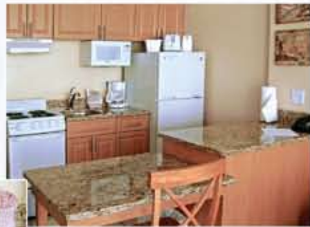
New dishwashers, stove/ovens, refrigerators, microwaves, toasters, coffeemakers, and more.

There's sawdust in the air at Daytona. We are in the process of remodeling all of the kitchens at the Daytona property. The new, brighter kitchens will include: new appliances, cabinets, fixtures, granite counter tops, and complete sets of cooking supplies and utensils.