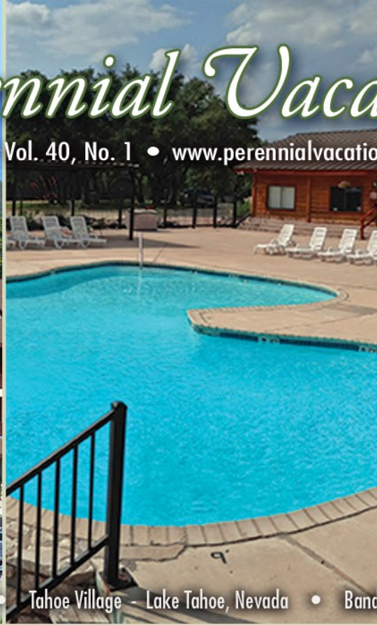
Tahoe Village - Lake Tahoe, Nevada