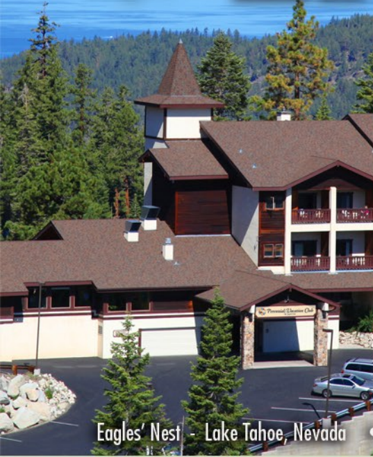
Eagles' Nest - Lake Tahoe, Nevada

Summer 2021 Vol. 40, No. 1 • www.perennialvacationclub.com • 1 (800) 35-WORLD