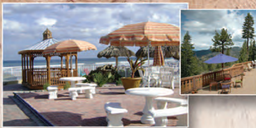
Sea Level Daytona or Mountain High Tahoe

Change is good...but if you are thinking X change, the earlier the bird, the better the worm!